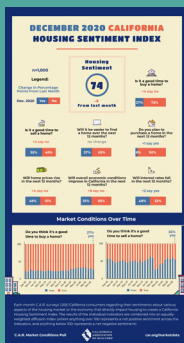
Market Data Infographics

Add something cool to your website, social media or next client meeting with beautifully designed and easy-to-download infographics for your clients and your specific market area: