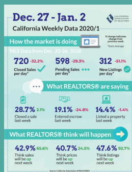
Weekly Market Minute Reports